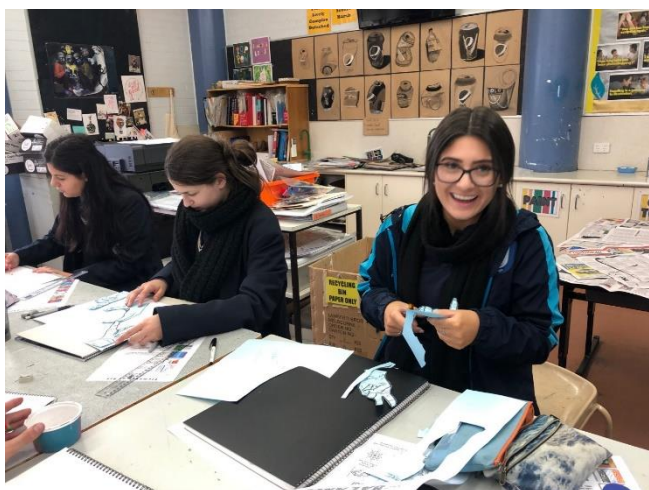
Years 9 & 10 students working on their 'Expressive Hands' Drawing. Students are extending their practical knowledge and understanding of Design Elements and Principles.